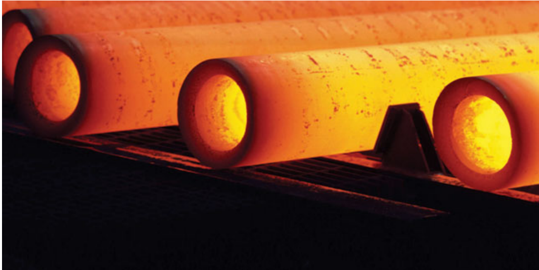
TIMKEN Steel - High performance seamless steel tubing

TIMKEN STEEL had previously been using long shaft vertical spindle pumps and the main problem with the use of these vertical spindle pump was the high repair cost, especially when the bearings failed, therefore TIMKEN STEEL has decided to purchase the HIPPO Medium/High Voltage Submersible Slurry pump® to replace the long shaft vertical spindle pumps.