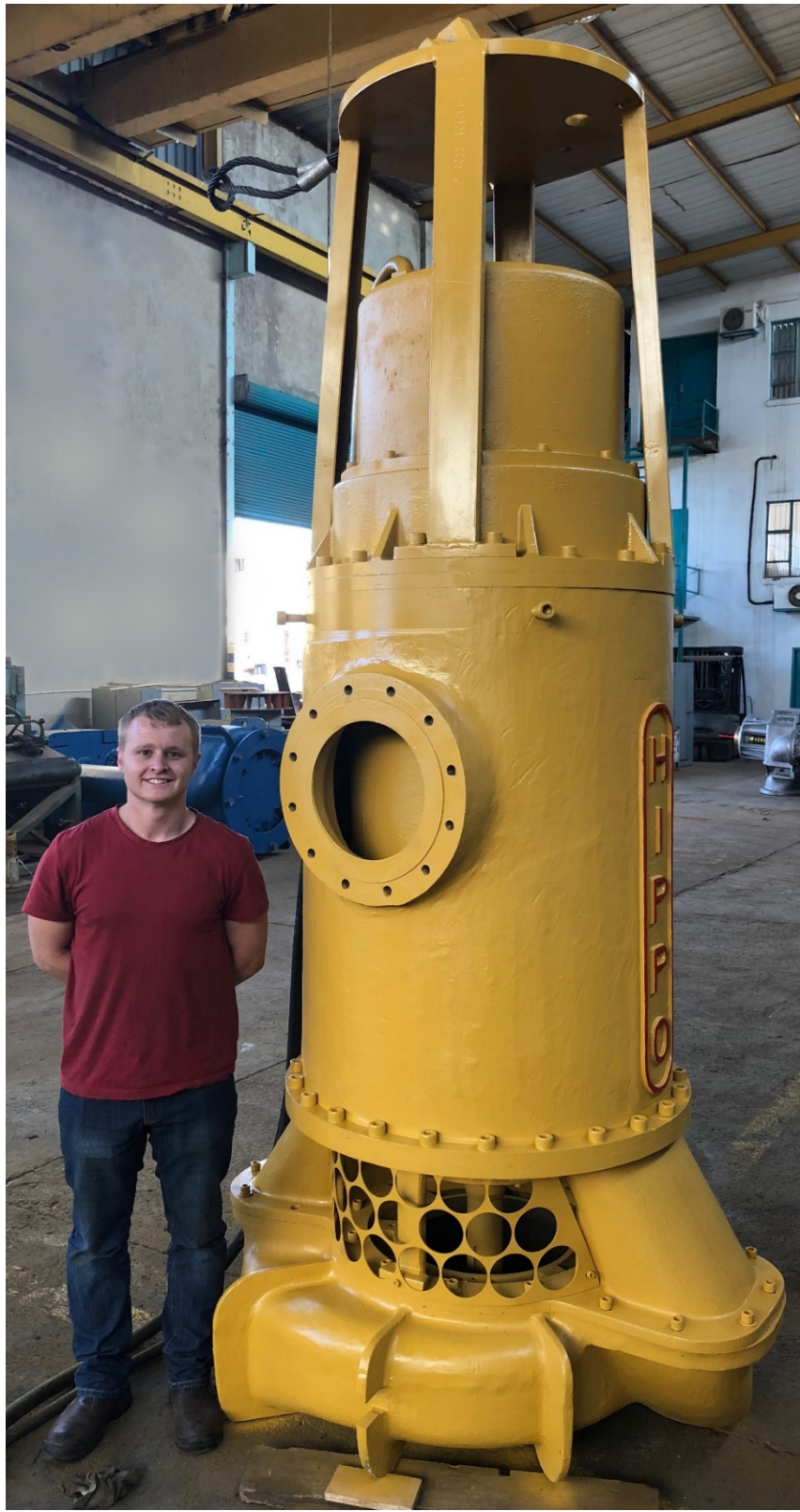
The HIPPO Medium/High Voltage Submersible Slurry Pump® specially designed and developed for TIMKEN Steel in Ohio, USA

The pump had been dispatched by ocean freight and is due to arrive in Cleveland on 11 November 2018 when it will be installed and commissioned immediately.